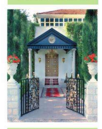
The Founder of the Bahá'í Faith

In October 2017 Bahá'ís all over the world will be celebrating the Bicentenary of the birth of Bahá'u'lláh, Founder of the Bahá'í Faith. Bahá'ís will be inviting the wider community to activities and special events throughout the coming months.